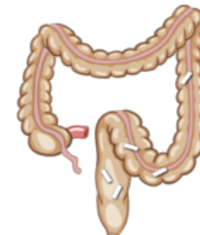
Illustration (Source: Medifactia) of the movement of the medical device Transit-Pellets through the colon, and how the transit time is calculated from the number of pellets retained.