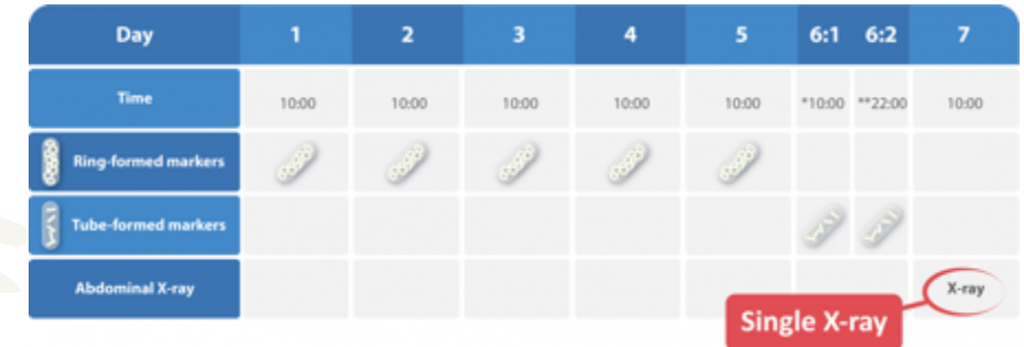
Schedule for marker intake with the Transit-Pellets method

The patient swallows' radiopaque markers for six consecutive days. On day seven, an abdominal radiograph is taken. Based on the number of retained markers and their position in the colon, the colonic transit time is calculated and compared to reference values. Because only one radiograph is needed, the radiation dose is limited, and the cost for the test kept at a minimum.