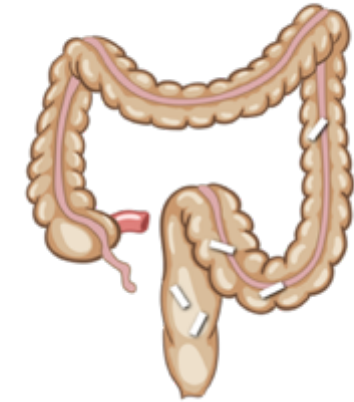
Illustration of the movement of the medical device Transit-Pellets through the colon, and how the transit time is calculated from the number of pellets retained.